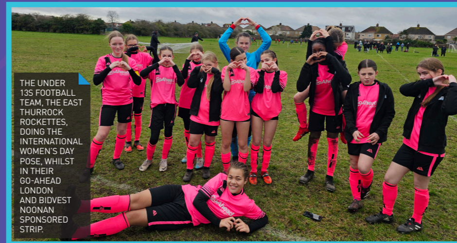
THE UNDER 13S FOOTBALL TEAM, THE EAST THURROCK ROCKETTES, DOING THE INTERNATIONAL WOMENS DAY POSE, WHILST IN THEIR GO-AHEAD LONDON AND BIDVEST NOONAN SPONSORED STRIP.