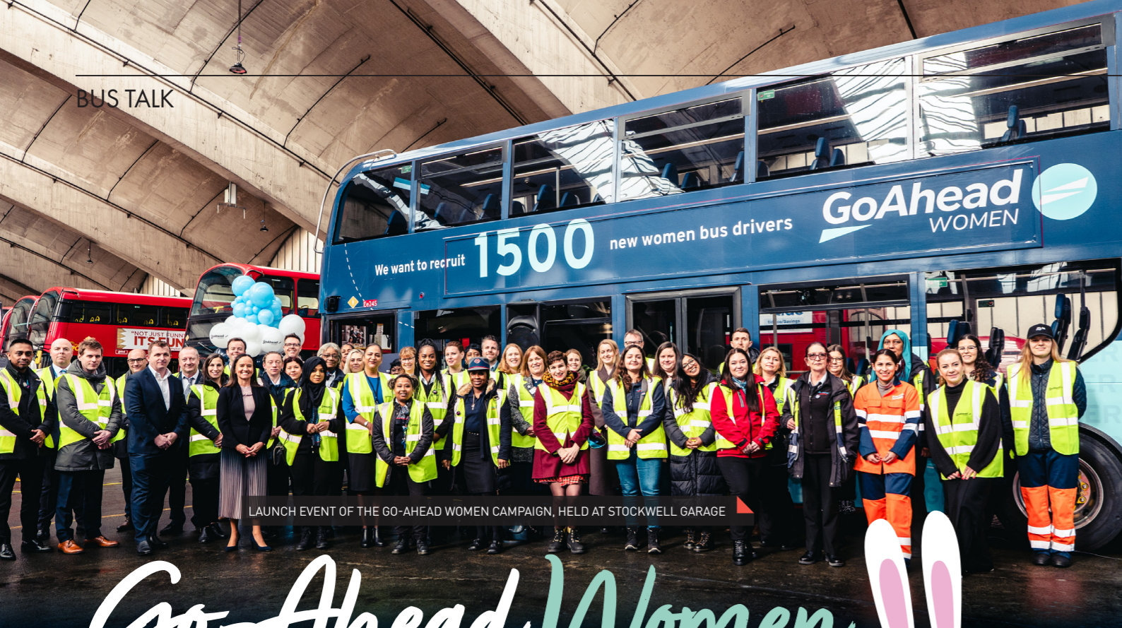
LAUNCH EVENT OF THE GO-AHEAD WOMEN CAMPAIGN, HELD AT STOCKWELL GARAGE