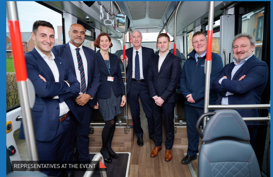
REPRESENTATIVES AT THE EVENT