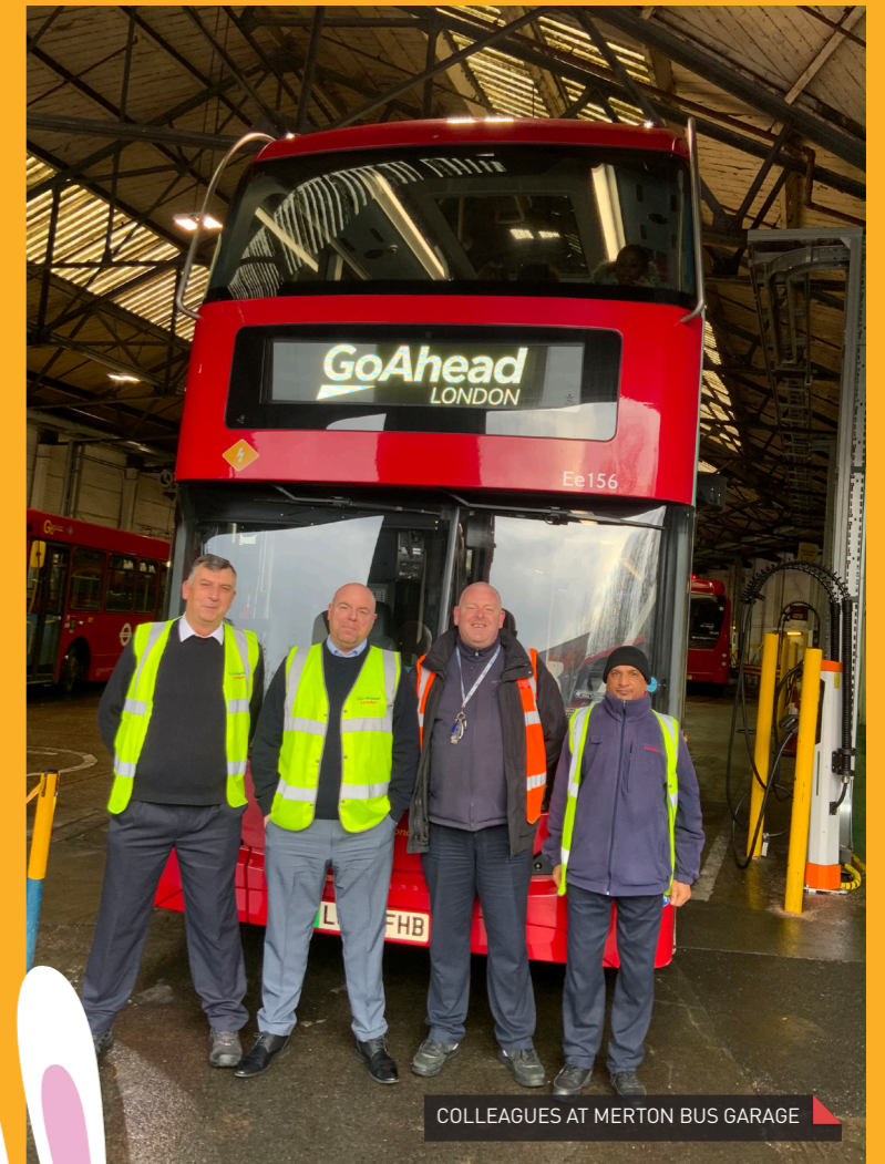
COLLEAGUES AT MERTON BUS GARAGE

We are pleased that the children enjoyed themselves and learnt during the process too.