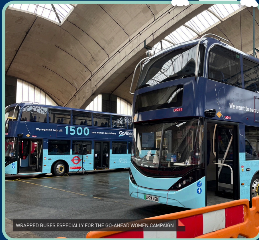
WRAPPED BUSES ESPECIALLY FOR THE GO-AHEAD WOMEN CAMPAIGN

https://www.goaheadlondon.com/careers/women-buses