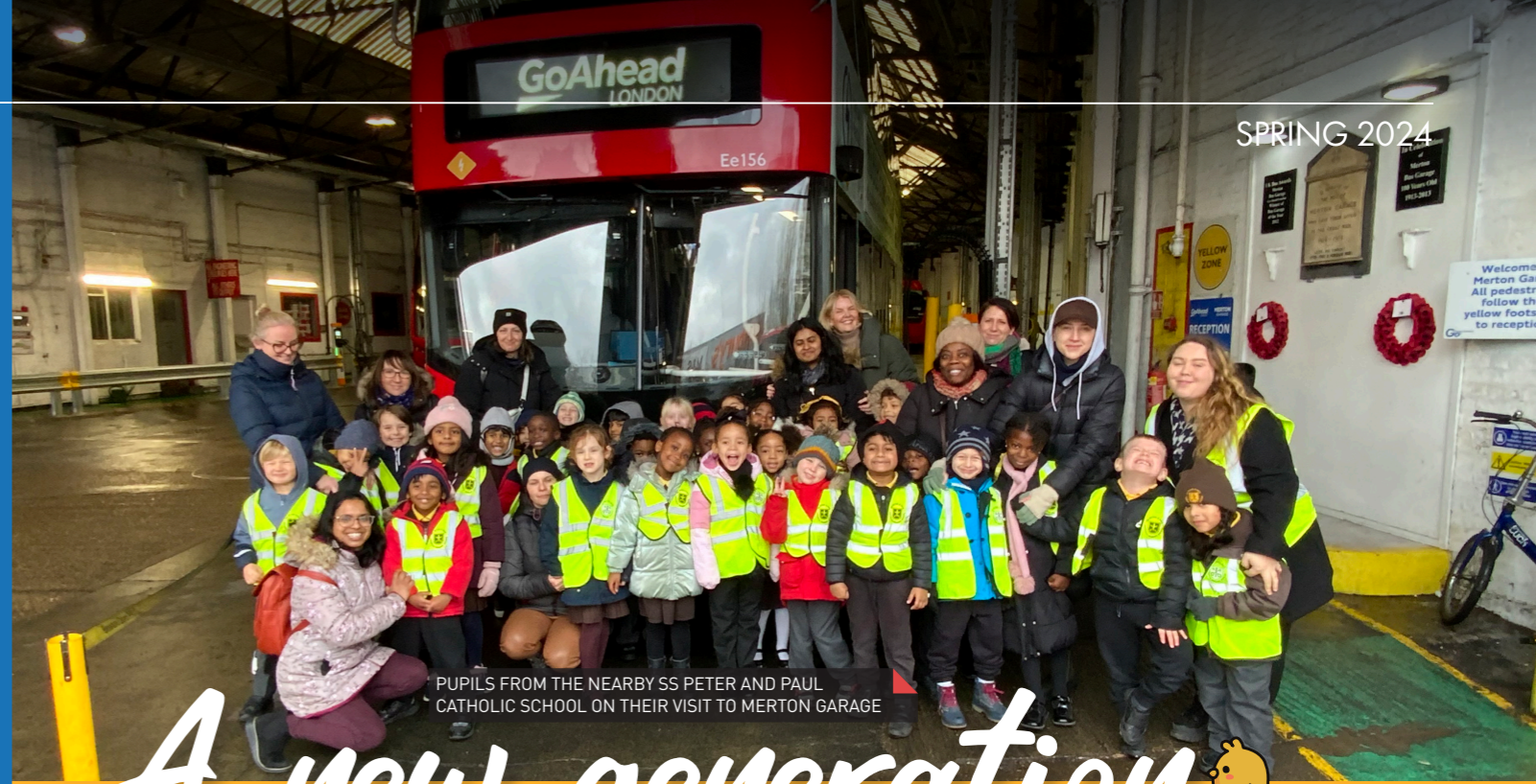
PUPILS FROM THE NEARBY SS PETER AND PAUL CATHOLIC SCHOOL ON THEIR VISIT TO MERTON GARAGE