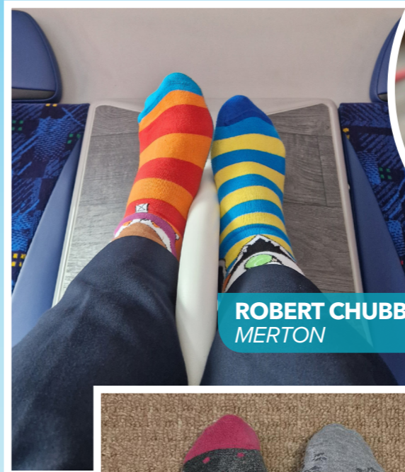
ROBERT CHUBB MERTON