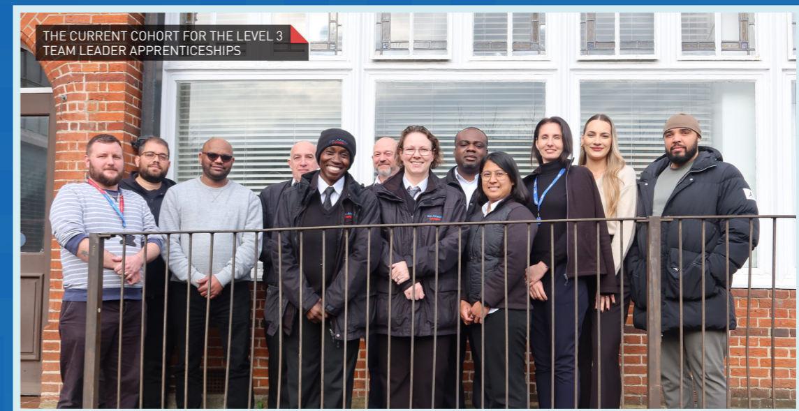
THE CURRENT COHORT FOR THE LEVEL 3 TEAM LEADER APPRENTICESHIPS