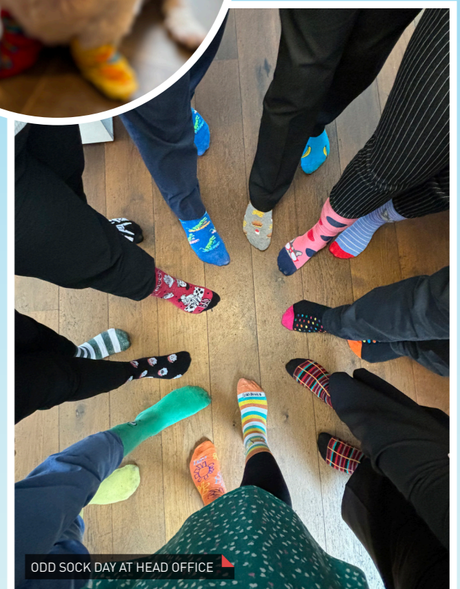
ODD SOCK DAY AT HEAD OFFICE