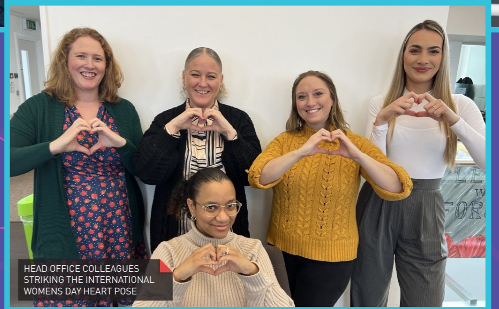
HEAD OFFICE COLLEAGUES STRIKING THE INTERNATIONAL WOMENS DAY HEART POSE

Alongside launching our Go-Ahead Women initiative on International Women's Day, our colleagues locally showed their support by wearing purple and striking the 2024 official pose.