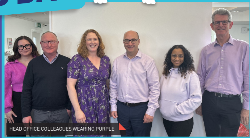
HEAD OFFICE COLLEAGUES WEARING PURPLE

On Friday 8 March, Go-Ahead London once again celebrated International Women's Day (IWD). International Women's Day is a global day celebrating the social, economic, cultural, and political achievements of women. Together we can celebrate achievements and fairness for all.