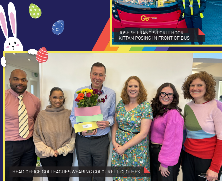
HEAD OFFICE COLLEAGUES WEARING COLOURFUL CLOTHES