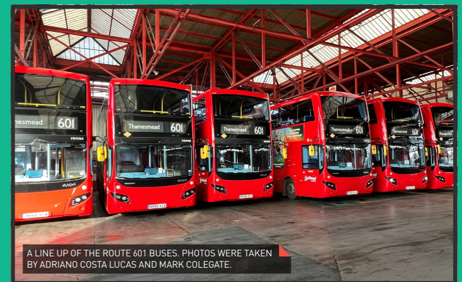
A LINE UP OF THE ROUTE 601 BUSES.