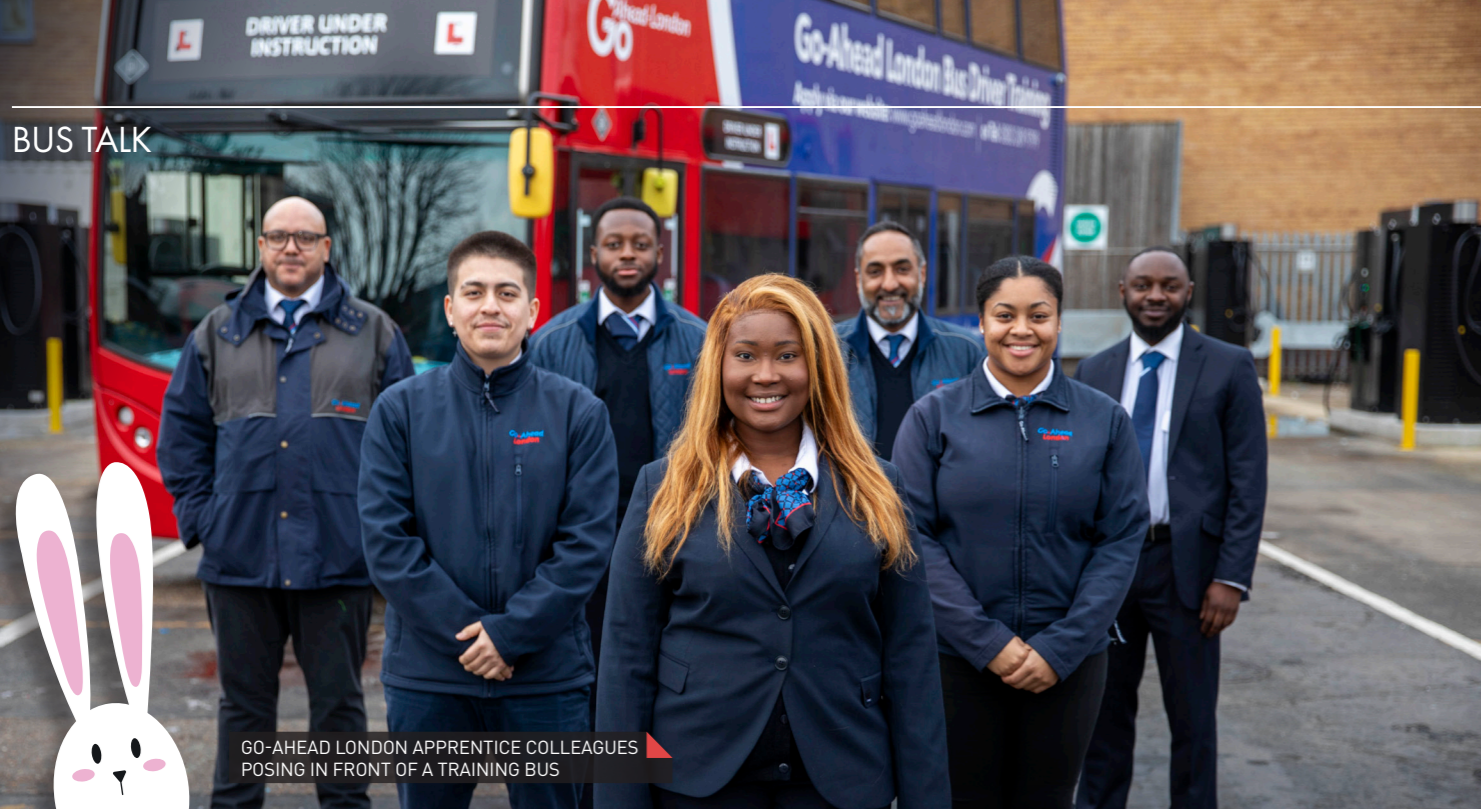
GO-AHEAD LONDON APPRENTICE COLLEAGUES POSING IN FRONT OF A TRAINING BUS